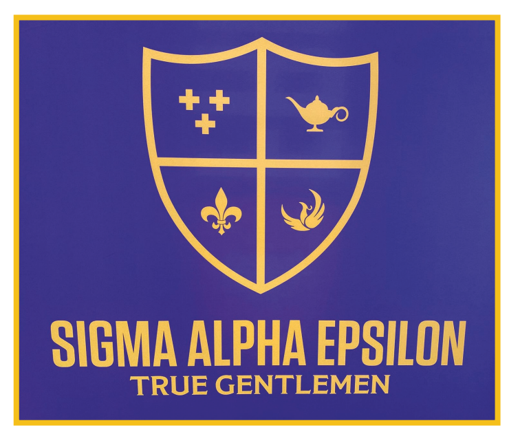
SAE introduced new branding at the Convention highlighting True Gentlemen.