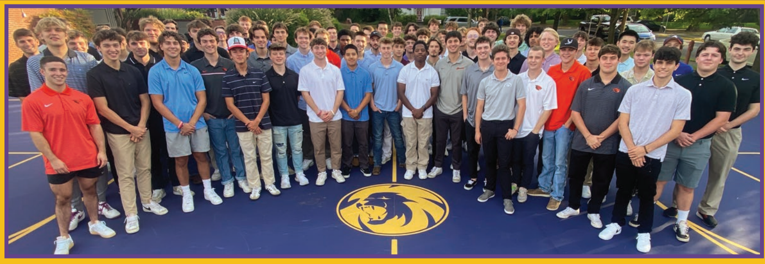
Oregon Alpha Chapter members October 2022. The Oregon Alpha House Corporation had a new purple surface added to "Moe Court" along with the addition of a lion center circle.